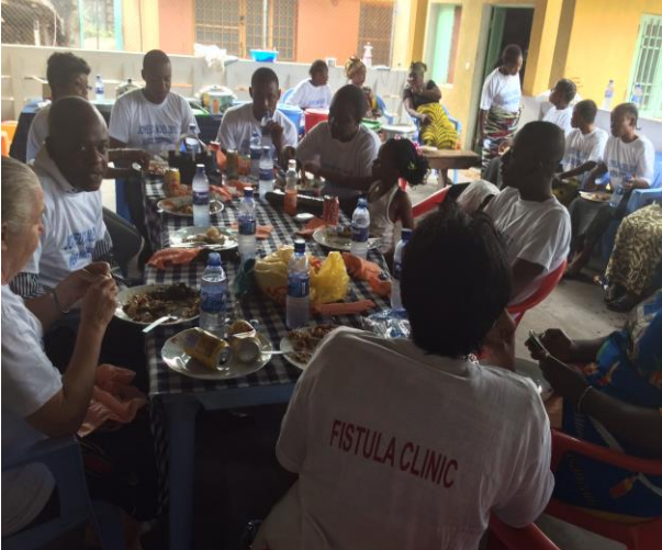
Christmas celebration with Fistula patients (St Joseph Hospital)