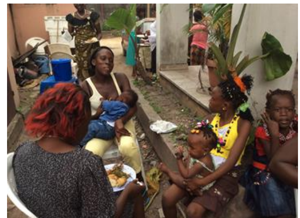
Wezesha women group in Kinshasa after training and New year celebration