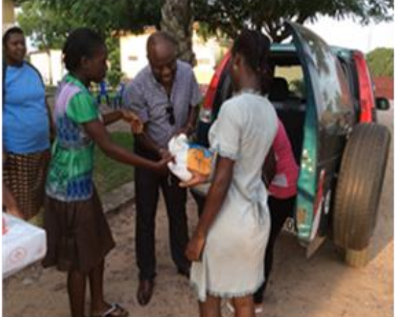
Sanga-Mamba Orphanage in Kinshasa (DR Congo)