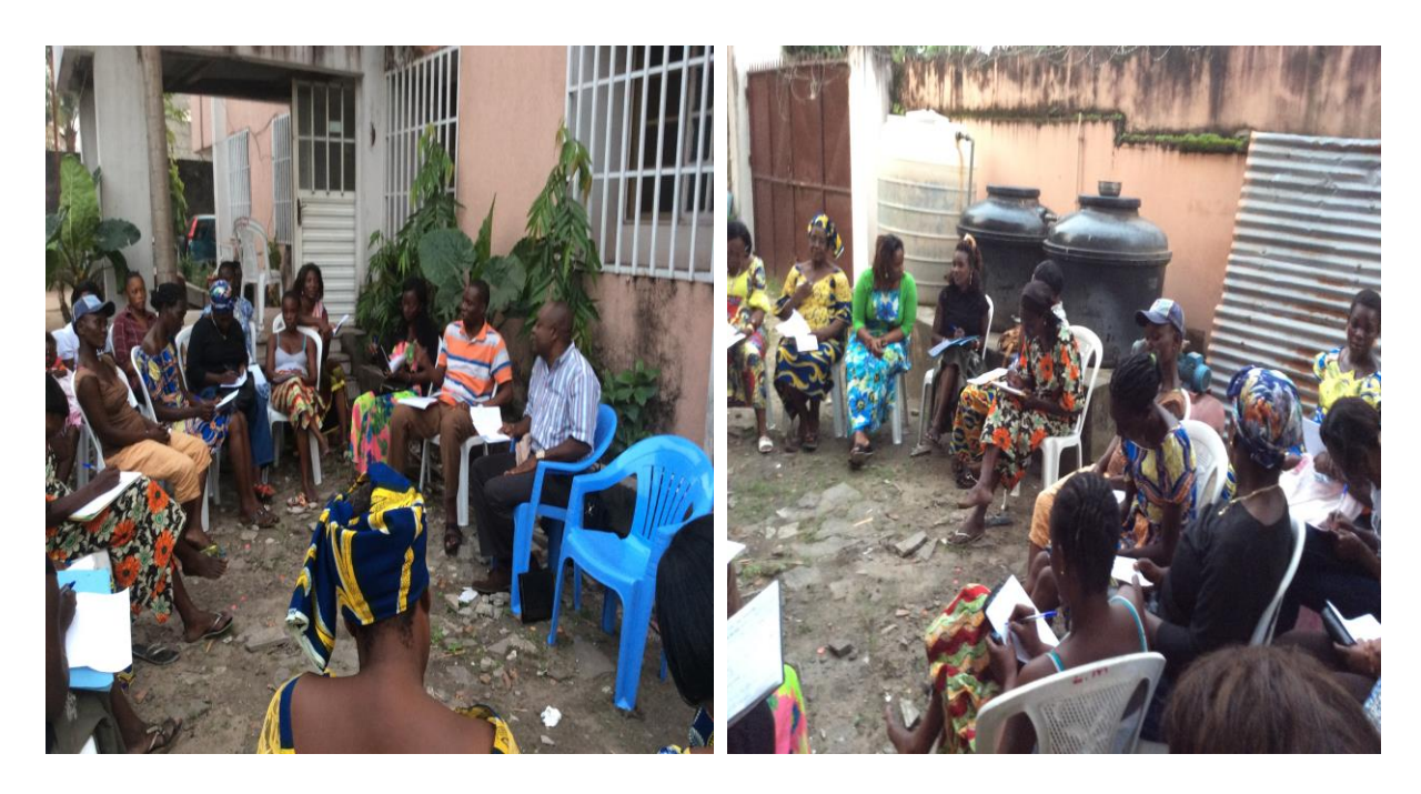
Meeting with women group in Kinshasa