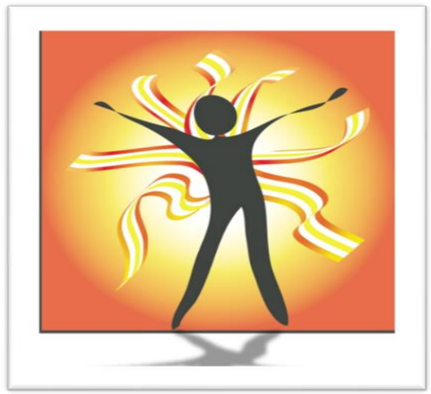
Empowering Women and Children in Africa