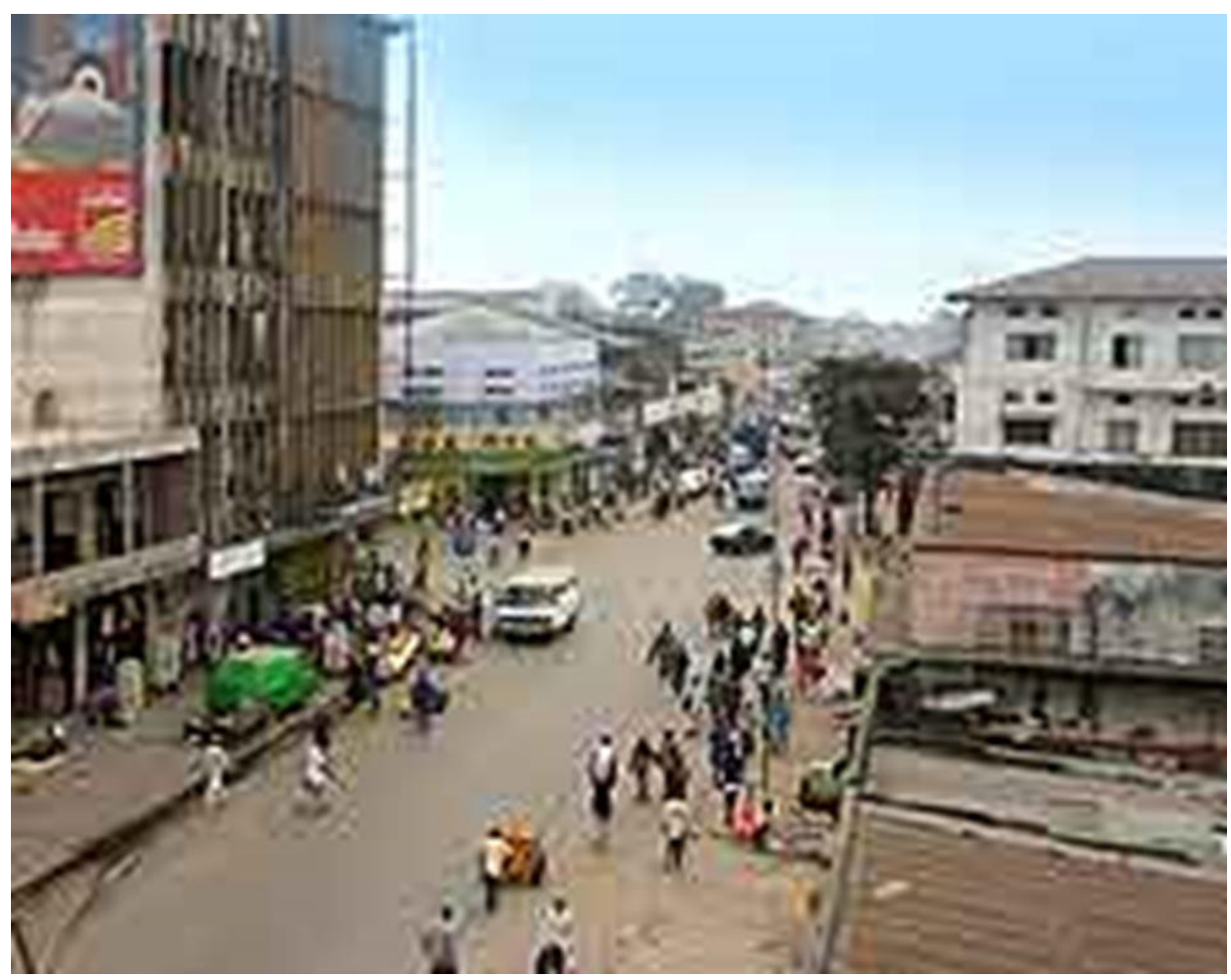
View of Kinshasa (DR Congo)