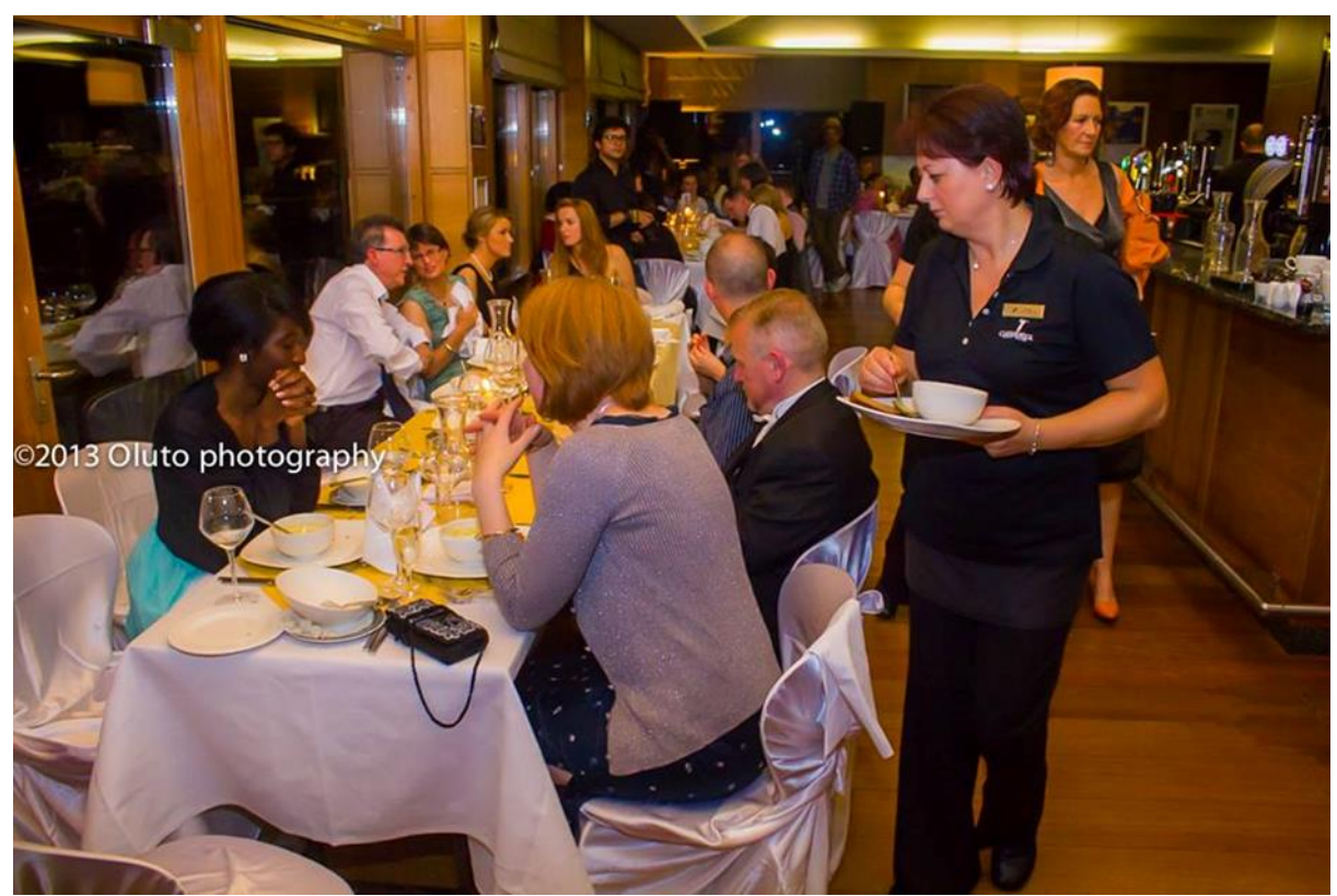
Wezesha fundraiser dinner in Castelknock Golf club, September 2013

Since its establishment in 2010 Wezesha has not solicited for funds to execute its work and most of the activities have been supported by the three directors using their own resources. In February 2013 Wezesha developed a work plan that included the sourcing of funds in order to advance work in DR. Congo. To date the organization has only raised very little money through self fundraising such as charity ball that raised €3000 in September 2013